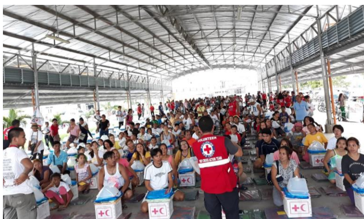
PRC distributing relief items (sleeping kit, hygiene kit and jerry cans) to 516 affected families in Enan Chiong Activity Center.

Since 20 September 2018, Philippine Red Cross (PRC) Cebu chapter has alerted the PRC National Headquarters (NHQ) through its Operation Centres, which function 24/7, about the landslide incident in Sitio Sindulan, Barangay Tinaan in Naga City, Cebu. PRC Cebu chapter attended the coordination meeting at Naga City City Hall with all responders and agencies on 20 September. After evacuation of the affected people, PRC Cebu chapter set-up two welfare desks and first aid station in two evacuation centres and has started the child play activities which was participated by 140 children. Welfare team is conducting psychosocial support programme (PSP) to five of the of the deceased relatives through counselling.