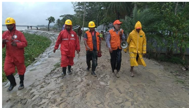
Red Crescent and CPP volunteers disseminating warning signals through megaphones and sirens.