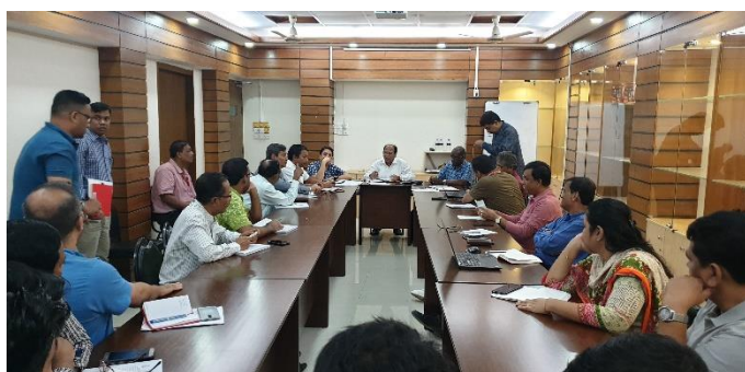
BDRCS called for an emergency coordination meeting with Red Cross Red Crescent Movement partners in its NHQ on 9 Nov 2019 morning.