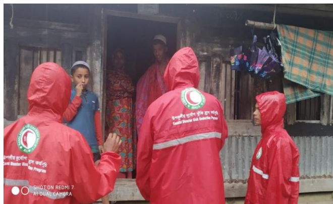
Red Crescent advising and helping people to evacuate to cyclone shelters.