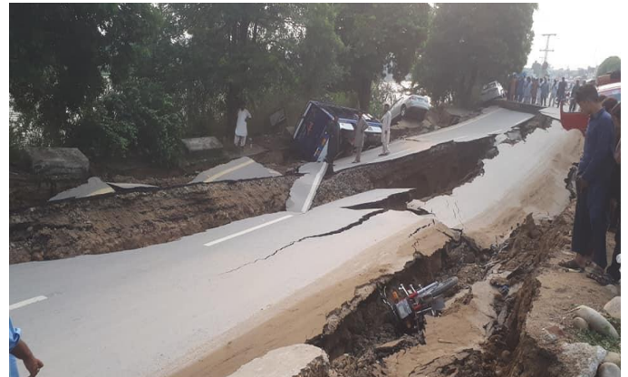
Severe main road damaged in Mirpur district due to the strong earthquake in Pakistan.

A powerful earthquake jolted several parts of Pakistan Administered Kashmir on 24 September 2019 at 4.02pm local time, particularly areas of Azad Jammu and Kashmir, Punjab, and Khyber Pakhtunkhwa. The earthquake severely affected Jatlan in Mirpur district, Azad Jammu and Kashmir. According to the US Geological Survey (USGS), the 5.8 magnitude earthquake struck at a shallow depth of 10 kilometers with its epicenter lying one kilometer southeast of Mirpur, Azad Jammu and Kashmir. According to the preliminary information, 19 deaths reported and more than 300 injured. The high intensity earthquake also caused severe to moderate damages to houses, buildings, and other infrastructure in Mirpur district. The main road along Mirpur to Jatlan along the Jatlan Canal is damaged and caused damages of vehicles on the road when the earthquake struck.