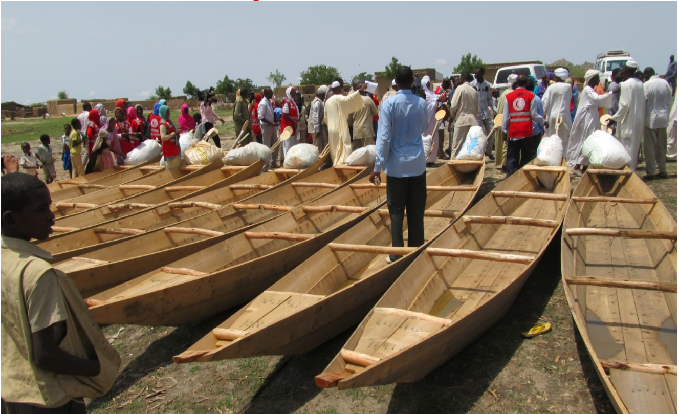
Equipped fishing boats for Alsalam and Algabalien – White Nile State.

Currently, in addition to the IFRC Country Office, there is an ICRC delegation, as well as 12 PNSs with in-country representation. Additionally, through pledges to programmes, 4 PNSs support the SRCS Humanitarian efforts. Such huge opportunities for supporting the NS had proved to be working in a harmony.