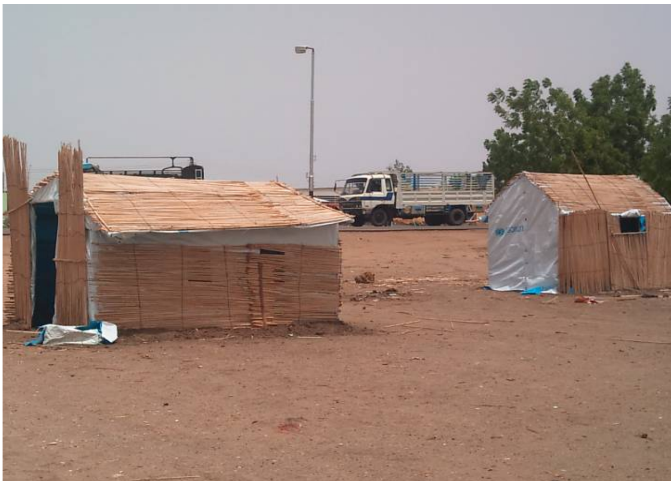
Model emergency temporary shelters constructed by SRCS Volunteers during Shelter training.

Business Line 3: To strengthen social and economic development by capitalizing on SRCS unique role, knowledge and expertise in Sudan