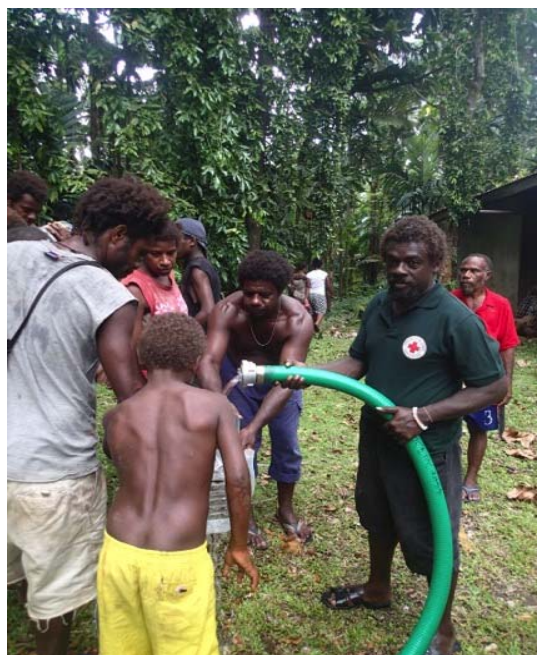
Providing NOMAD filtered water to affected people

This bulletin is being issued for information only and reflects the current situation and details available at this time. The International Federation of Red Cross and Red Crescent Societies (IFRC) is not seeking funding or other assistance from donors for this operation. The Solomon Islands Red Cross will, however, accept direct assistance to provide support to the affected population.