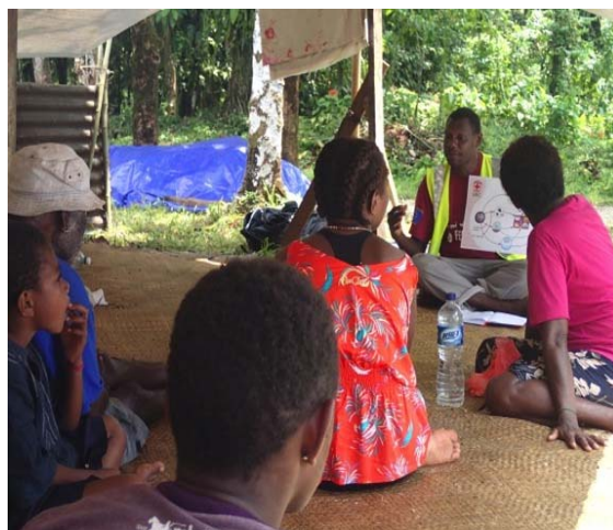
Giving hygiene promotion messages to displaced people settled on higher ground.

The National Disaster Management Office (NDMO) believes there are no more gaps in the immediate relief supplies required. However, the prepositioned stocks of the Solomon Islands Government and NGOs in Honiara and Lata have been depleted and support is being sought to replenish these stocks.