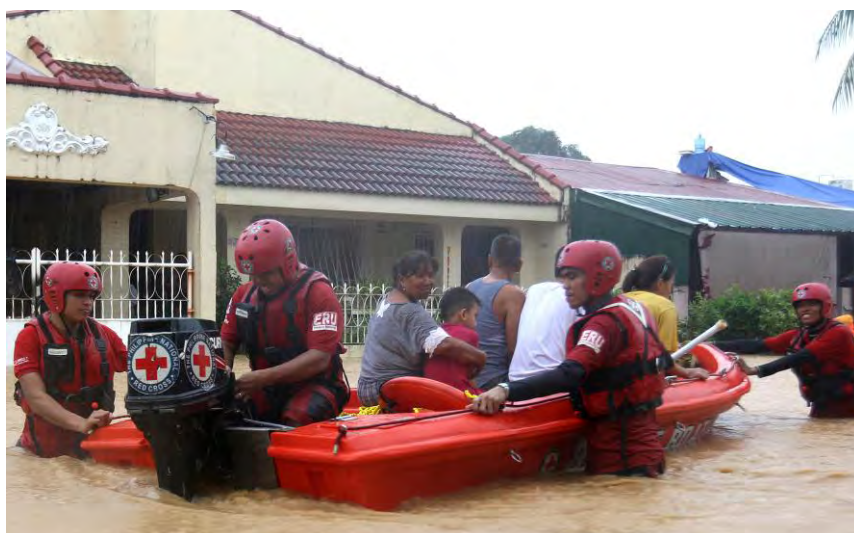
Philippine Red Cross emergency responders have helped rescue more than 300 people trapped at Barangay Santa Monica, north of Subic Bay at the height of flooding brought about by Typhoon Usagi.

Through its operations centre at the national headquarters, PRC has maintained the line of communication with the chapters concerned since the weather disturbance began, by sending out advisories. The PRC national headquarters immediately deployed water search-and-rescue teams to the most affected areas of Zambales and helped transport 300 people who were trapped inside or on the rooftops of their homes.