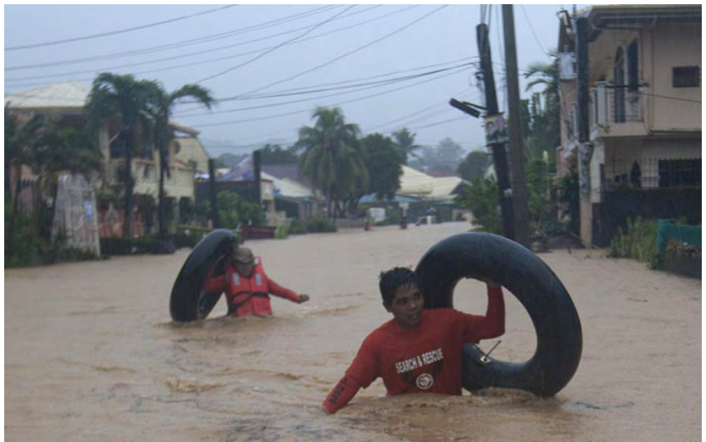
The latest wave of flooding prompted the evacuation of thousands of families as floodwater reached levels that submerged houses in parts of Bataan and Zambales provinces.

The flooding in Zambales comes seven weeks after Typhoon Utor (local name: Labuyo) struck the provinces of Aurora, Nueva Ecija and Quirino – prompting PRC to launch a significant operation – followed back-to-back by flooding brought by monsoon rains induced by Tropical Storm Trami (Maring), which affected Metro Manila, its four neighbouring provinces and parts of Central Luzon. To support a scaled-up intervention by PRC, IFRC launched an emergency appeal seeking CHF 1.9 million (approximately USD2 million) to support the delivery of assistance to 75,000 people. Considering several severe weather events are likely to affect the Philippines into 2014, the emergency appeal covers the entire 2013 typhoon season. As such, the response in Zambales may be incorporated into the emergency appeal operation if analysis of the assessment findings indicates the need for a significant response by PRC.