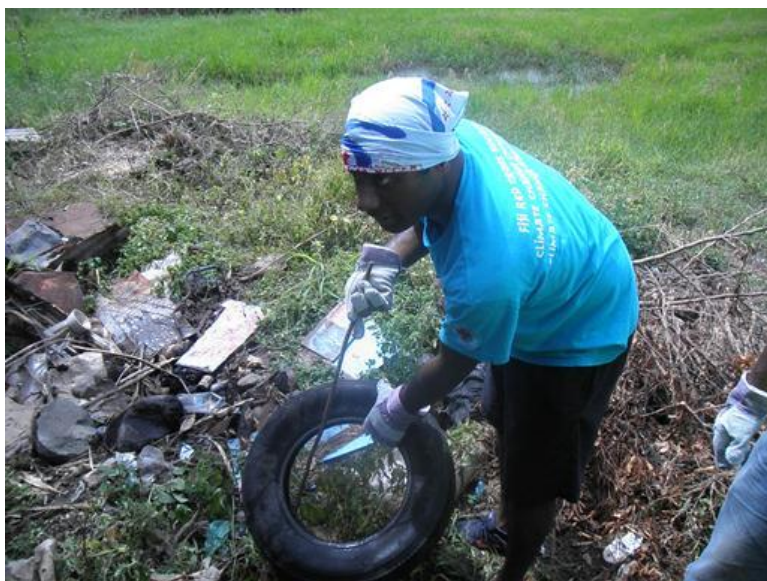
Fiji Red Cross Society staff member supporting volunteers in the dengue community clean-up at Colase settlement, Rakiraki.

<click here for detailed contact information>