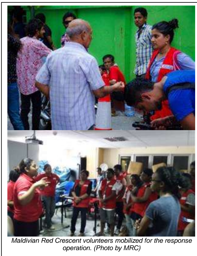
Maldivian Red Crescent volunteers mobilized for the response operation.

IFRC South Asia Regional Delegation and the Asia Pacific Zone Office are working with MRC to support the relief and response efforts. DREF request is presently being considered.