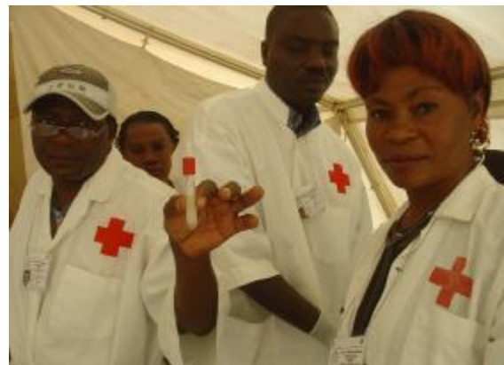
This sample is very cloudy... which, according to the Treguine medical team, is not a good sign.