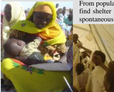
Children & adults schools are quite well organized in Treguine camp

The security situation in Eastern Chad has been quite stable since the beginning of year 2005. The Governor of the Region of Ouaddai (where the camps of Brédjine, Trédjine and Farchana are located) argued this morning in a meeting with the UNHCR and partner agencies that security in his region is fully strengthened. He said the Chadian military forces are deployed all over the zone of the Sudanese refugees operation and all along the boarder with Sudan to maintain peace and order; and mostly to protect the humanitarian aid workers in Eastern Chad. He therefore encouraged all the humanitarian organizations working in the refugees operation to carry on with their duties, but in the limits of their mandate.