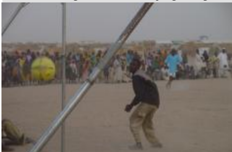
A goal by Treguine refugees' team against Oxfam

The operational budget for this Appeal addresses the needs of up to 60,000 refugees until December 2005, taking into account the needs of the local population and integrating ongoing relief activities into the developmental programmes of the national society. Also included in the revised plan of Action and budget are the needs to take on the management of Bredjing camp. An assessment team has been deployed in the field during the second week for recommendations, and further options.