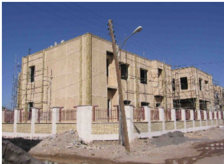
Montazeri is one of the standard schools which has entered a final stage of implementation, alike the other four school sites

The construction of the standard schools has entered a final stage of implementation, with all five school sites reaching the same level of completion. Most of the works have been completed, which include superstructure, masonry walls, internal partitions, plastering, stone works, wall surfaces, mechanical and electrical works, air-conditioning, channelling, insulations, etc. Paint colours have been chosen for corridors and classrooms and the painting of interiors commenced in some sites.