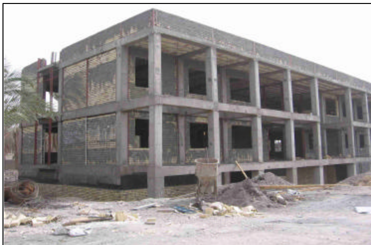
The construction of the IRCS branch office in Bam is one of the projects implemented with the German RC support

The German Red Cross funded projects have been implemented by the IRCS' Construction Department. These projects include the establishment of an Orthopaedic Centre, IRCS branch office in Bam, the construction of the IRCS storage facilities and the rehabilitation of the IRCS Bam branch community centre. They are in different stages of construction and are expected to be completed by the end of 2006.