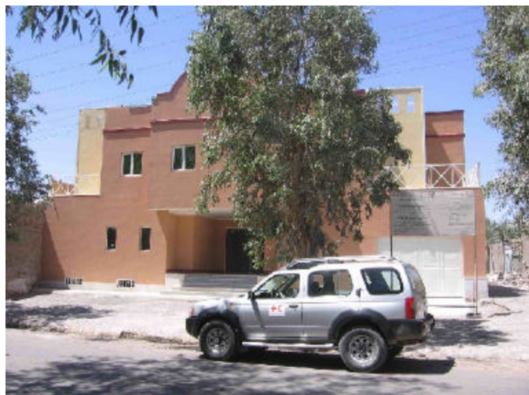
Despite the delay, by the beginning of June 2006, the construction of the UHC was completed

The long holiday period in Iran at the end of March and the beginning of April 2006 had a negative impact on accelerating the construction of the UHC. Workers did not return to work in time and the final works of the UHC were delayed by the lack of finishing materials. Besides, the construction was affected by the frequent cut of water and electricity. All this caused some further delay in completing the construction.