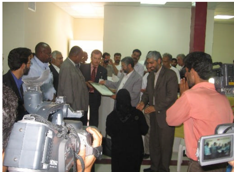
The handing over ceremony of the the Zia Urban Health Centre to the Ministry of Health on the 11 th of June was attended by representatives of different parties involved