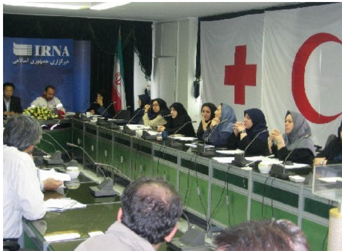
The DM training workshop conducted by the Federation Delegation for 35 journalists of the Islamic Republic News Agency (IRNA) covered many topics ranging from Red Cross/Red Crescent Movement to DM related issues

In May-June 2006, the Federation Delegation held several meetings with the United Nations Office for the Coordination of Humanitarian Affairs (UNOCHA) in Tehran to improve coordination between the Federation/IRCS and UN agencies during emergencies in Iran. At the end of these meetings the two sides have agreed to form a working group to identify the concrete areas for mutual cooperation and come up with recommendations for practical steps.