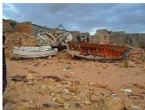
Many fishing boats were also damaged or destroyed along the Somali coast.

The peninsula of Hafun still remains the single site suffering the most profound effects. Access to Hafun is however still hampered by the poor road conditions approaching the town. WFP in particular has reported continued difficulties in transporting food relief there this week, since large trucks traveling from Bosaso are forced to stop at Foar, around 50 km from Hafun. The small 4x4 trucks that continue to shuttle relief to the town are being used by WFP and UNICEF amongst other agencies.