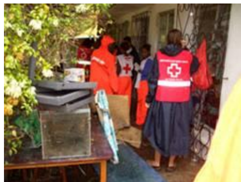
Seychelles Red Cross Society Disaster Response Team members were deployed to assist the affected communities.