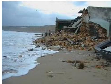
Damaged dwellings along the Somali coast.

UN-OCHA estimates that the tsunami affected about 18,000 households: the appeal uses a working population figure of 54,000 people, an average of 3 people per household instead of the usual average of 6 people. Many of those affected were living in small villages along the coastline, and the numbers of seasonal migrant fishermen have made it particularly difficult to get accurate estimates of population numbers and family size. In addition to the deaths of 150 people, a large number of shelters were either damaged or destroyed, wells were washed away or contaminated with salt water, and a large number of fishing boats and equipment were lost.