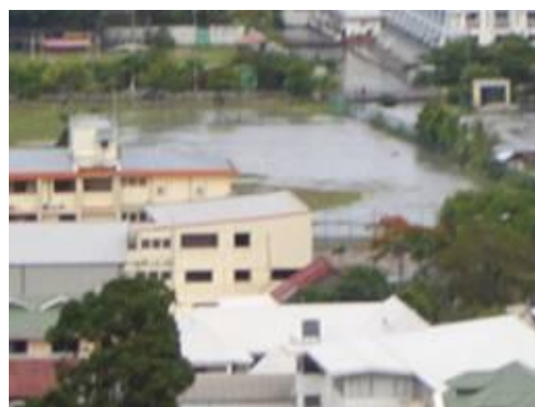
Aerial view of flooding in Mahé, Victoria Island.

On the 26 December, all available volunteers and trained Disaster Response Team Members were alerted and placed on standby upon receipt of the alert from the meteorological office. The Executive Committee and