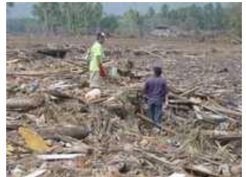
Surviving residents pick through the ruins trying to salvage some semblance of their former lives.

The Indonesian government has produced maps of the affected areas, which will be updated over the coming weeks. The statistics indicate that the highest concentration of IDPs is in the north of Aceh Province, with Aceh Besar at the northern tip and in Aceh Utara on the west coast, the most affected area (50,001-116,984 IDPs).