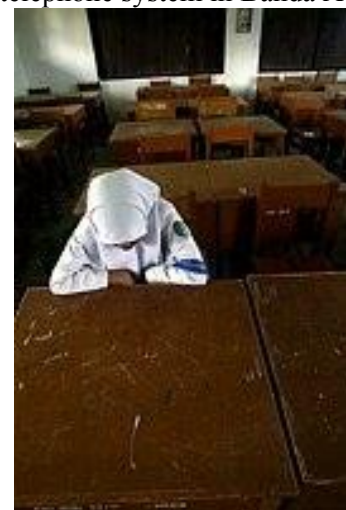
An Acehese Muslim high-school girl sits in a classroom before the start of the first day back to class in the tsunami-hit town of Banda Aceh on the Indonesian island of Sumatra January 10, 2005. December 26's 9-magnitude earthquake and subsequent tsunami killed at least 156,000 people along the Indian Ocean, with Aceh province accounting for almost all of Indonesia's 104,000 deaths.  REF: ACE14D2

The Federation is recruiting 35 field delegates for Sri Lanka, Indonesia, Kuala Lumpur, Maldives and a delegate for the Federation office in New York. While candidates are being considered for seven of the posts, a total of 29 posts, as detailed below, are still to be filled. The recruitment of head of operations for Indonesia is extremely urgent.