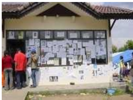
Photos of missing people are put up over Banda Aceh by friends and families hoping for news.

PMI continues to reunite families in Banda Aceh and other affected areas through a tracing and messaging service set up in cooperation with ICRC. The service, also known as restoring family links (RFL) also has an emergency post in Jakarta. Since opening in early January 2005, the PMI Banda Aceh emergency post alone has served a total of 1,837 RFL cases: 1,082 reports of missing relatives, 14 unaccompanied minors, 664 “I’m alive” forms filled in, 15 people sending Red Cross messages, and 62 who used free phone conversations via satellite to contact their relatives