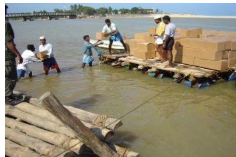
Red Cross relief supplies being ferried by barge at Arugam Bay.

The past five days of relief distributions in the Ampara district has seen 60 trucks and a total of 250 MT of goods go out from the American Red Cross' ERU warehouse. Standard Federation non-food relief items (NFRI) distributions by SLRCS and the ERU recently extended from Pottuvil to Arugam Bay, which can only be accessed by barge as the bridge connecting the two points is down. Supplies have been ferried across the bay by inflatable boats provided by the Canadian Dart Team, a boat provided by the Sri Lankan Navy and a makeshift ferry (a wooden platform across two small boats with outboard motors) provided by the Sri Lankan government. On the other side, supplies have been transported to the two distribution centres on trailers pulled by farm tractors. Distributions are being carried out in schools, hotels, camps and other community centres and altogether some 3,000 families have been assisted.