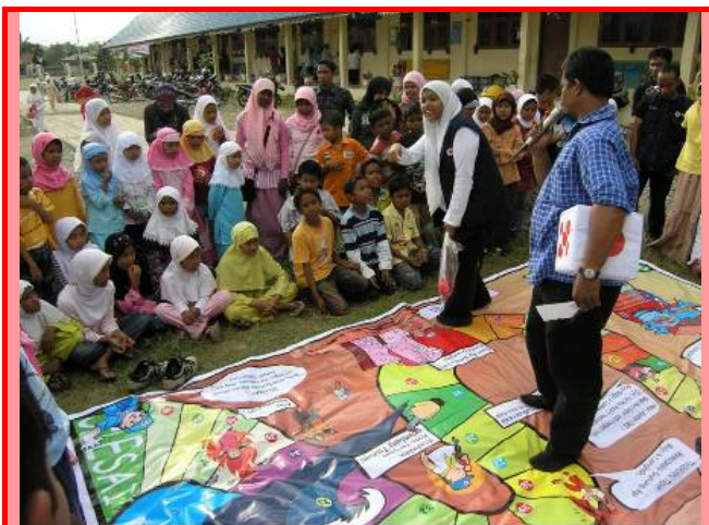
PMI staff lead students at Islamic School Rukoh Darussalam in a game aimed at increasing their disaster preparedness skills. This was part of the integrated community-based risk reduction programme.

Working closely with PMI and the International Federation Secretariat, the British Red Cross are supporting community disaster risk reduction activities. During the reporting period, the British Red Cross completed emergency preparedness and response training in 17 villages in Aceh Besar district, including establishment of CBAT. The CBAT mapped the village vulnerability which will further lead to development of disaster risk reduction (DRR) plans for each community. Various DRR works were undertaken, including coastal plantations, emergency evacuation routes, channel draining, and riverbank protection. While British Red Cross will be completing its programme in mid 2008, other organisations, in addition to PMI, have shown interest in continuing their support of DRR activities in these communities.