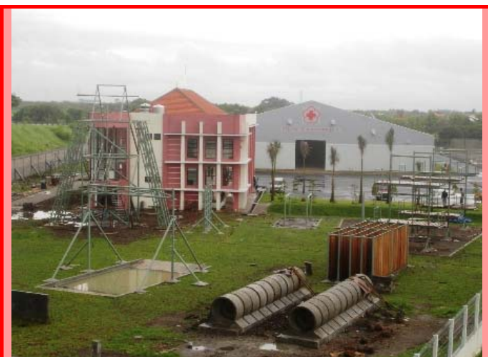
The Norwegian Red Cross contribution to the tsunami operation also covers the construction of a central warehouse and training centre in Gresik, Surabaya, which is part of PMI's nationwide plan.

On 22 November 2007, the new PMI branch in Nias Selatan was inaugurated. The branch held a planning meeting with the International Federation Secretariat and the Spanish Red Cross in February 2008. The International Federation Secretariat has supported the branch to employ staff and conduct orientation/training on the Red Cross Red Crescent Movement for the board members and staff. The basic volunteer training course is currently being planned for more volunteers.