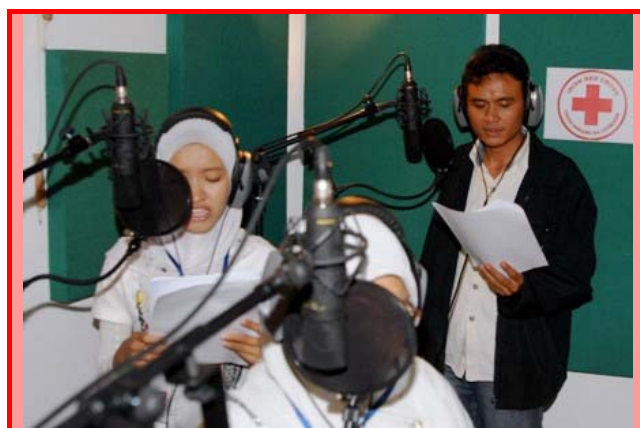
Voice actors recording their vocals for Rumoh PMI radio drama in Irish Red Cross audio production facility in Banda Aceh.

The organizational development programme aims to enable the board members, staff and volunteers to represent PMI, and the Red Cross and Red Crescent in general, with confidence. A seven-day basic volunteer training course is being provided for a core team of approximately 30 volunteers per branch. The topics provided in the training include the history and role of the Red Cross Red Crescent Movement, first aid, evacuation, coping with mass casualties, organizing temporary shelter and field kitchens, home nursing, tracing and mailing services and community health. During the reporting period, basic volunteer training was conducted in five branches and is still ongoing in others. Furthermore, the International Federation Secretariat and Aceh chapter of the PMI have planned orientation training for 225 staff and board members. The training was expected to commence in May.