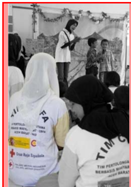
The CBFA programme of the Spanish Red Cross uses a variety of activities in promoting healthy behaviour, such as theatre play in Aceh Barat.

Besides CBFA programmes, Red Cross Red Crescent partners are also carrying out other health programmes. For example, the American Red Cross is implementing an avian and human influenza prevention project in five provinces across Java and Sumatra. So far, the project – with active involvement of PMI volunteers – has reached more than 500,000 high risk individuals with messages on risks and prevention methods through outreach activities in schools, villages and traditional markets. Additionally, in partnership with the World Food Programme (WFP), the American Red Cross is striving to improve the nutritional well-being of tsunami-affected mothers and children through schools and posyandu (local health post) on the east and west coasts. Through the programme, fortified biscuits and noodles are distributed to school children in 811 schools, children aged under five years, pregnant women, and mothers in 1,122 posyandu . To date, 3,811 health cadres and 1,437 teachers have been trained in nutrition promotion.