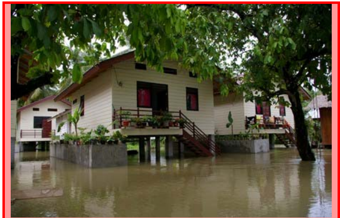
The elevated house and sanitation system constructed by the British Red Cross in Gampong Baro, Teunom sub-district, Aceh Jaya are designed for flood prone areas.

The water and sanitation aspect of the houses in Aceh are provided by the American Red Cross while the International Federation Secretariat is providing water and sanitation facilities for the houses constructed in Nias Island. Overall, the Canadian Red Cross construction project has been experiencing fewer challenges than before, thanks to the increased support and cooperation provided by the community members and village leaders. Some issues related to lack of access to community due to poor road infrastructure are being solved through construction of a temporary access road in cooperation with the local authorities.