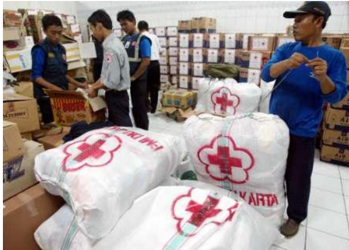
Indonesian Red Cross staff and volunteers are mobilizing relief supplies in Jakarta to be sent to the tsunami-hit Aceh region.

The health department has been involved in evacuating the establishing a 24-hour health providing health services in local provincial health office of North local hospital are ready to to Aceh. Four tons of medicine, baby food and 150 body bags transported on 27 December by with a government assessment vice president. The social affairs buffer stocks available in Aceh, tonnes of rice, food items, and (live vests, generators, boats etc.). tonnes of rice, food items, kitchen utensils, and evacuation delivered from North Sumatra to land transportation.