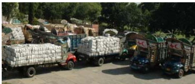
Another convoy of relief items readies for departure from the Pakistan Red Crescent's national headquarters in Islamabad

A total of 39 regional disaster response team (RDRT) members have been mobilized for this operation. The South Asia regional delegation has most recently deployed three from Bangladesh Red Crescent, five from Nepal Red Cross and two from Afghanistan Red Crescent to various locations in Pakistan. They will assist the Federation and PRCS relief coordination team in the society's national headquarters, Mansehra and at distribution sites in the affected areas. Meanwhile, the RDRT members from Southeast Asia (Malaysian Red Crescent, Philippines Red Cross and Singapore Red Cross) have since their arrival on 15 October been supporting the FACT in assessing the remote areas north of Balakot, with relief distribution and medical care, and supporting the Spanish Red Cross' basic health care unit.