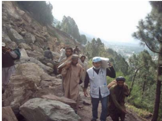
Pakistan Red Crescent medical teams are pushing up into the hills to reach remote communities

The Pakistan Red Crescent's team in Batagram has had to have escorts for their safety due to threats to their safety by frustrated local people. Locals are demanding tents and other items whenever they see a humanitarian agency, and even though they require medical assistance, have vented their anger on the medical team.