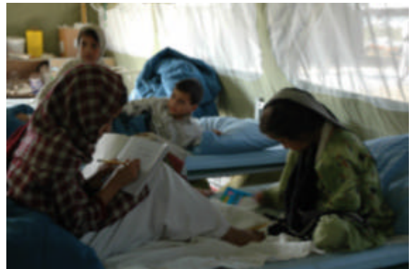
Children injured in the disaster are receiving treatment at the Federation multi-national hospital, Abbottabad. Red Cross Red Crescent volunteers also run some education programmes

As the rehabilitation of damaged health facilities will take time and many organizations are already seeing cases of disease linked to poor sanitation, the Federation will focus increasingly on sanitation and hygiene support and will continue to expand the operation of mobile health services in the next six months. It will also seek to include