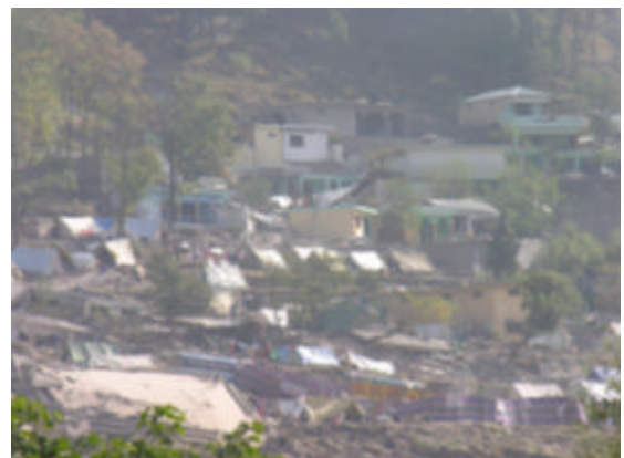
Concerted efforts to clear up debris since the earthquake has dramatically increased the death toll in the country

Pakistan and leading international agencies have estimated that the ongoing relief operations in North West Frontier Province (NWFP) and Pakistan-administered Kashmir (PAK) could be completed in one year but the reconstruction of houses and infrastructure could take four to five years. The first draft of a damage assessment is