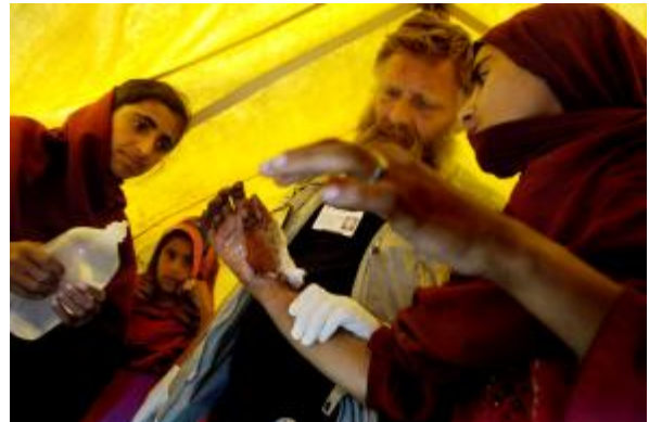
The Federation mobile health clinics continue to treat people injured as a result of the earthquake

Watery diarrhoea cases have been reported across all primary health units and suspected diphtheria identified in Ghari Dopati. Two cases of meningitis and small cases of measles and mumps were also reported, though it is unclear if these are similar to pre-earthquake numbers. The Federation has made a request from the epidemiology department of the World Health Organization (WHO) for media culture to be supplied to ERUs and field hospitals so that samples can be sent back for analysis.