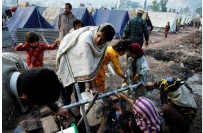
Improving water supplies and sanitation in densely populated tent villages is crucial to keeping cholera and other serious waterborne diseases at bay

United Nations officials announced that hundreds of earthquake survivors in tented villages in Muzaffarabad, the regional capital of Pakistan administered Kashmir (PAK), have been affected with acute diarrhoea and doctors are investigating whether they are cases of cholera. Snowfall, rain and freezing winds are all set to multiply the challenges faced by aid workers to control the further spread of waterborne diseases, which could pose an added threat to survivors. The need to scale up efforts to provide a safe water supply, adequate sanitation facilities and emergency health care is now a priority.