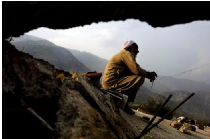
An estimated 1.1 million people have lost their livelihoods in earthquake affected areas of Pakistan

At the 19 November donors' conference in Islamabad, the international community made aid commitments and pledges for relief, rehabilitation and reconstruction of earthquake-hit areas of nearly US $5.9 billion, which surpassed the target set by the Pakistan government and international lending agencies. Most of the money was in the form of soft loans, not grants - critics forecast this may contribute to the country's debt burden in the long term. The Pakistan government has provided donors with firm guarantees of transparency regarding the use of the funds.