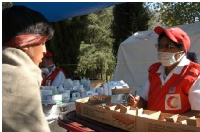
The mobile medical teams continue to expand beyond main towns to reach communities in isolated and remote areas

The Federation recently agreed to facilitate the opening of a PRCS branch office in the Besham Civil Hospital. A base is now being established there by the Federation health team that includes two RDRT nurses to support PRCS in the area of health activities. In the coming week the team will set up an office, receive stock, liaise with the PRCS representative who will establish a new base for the branch office, and assist with the recruitment of PRCS staff (one doctor and one paramedic/woman health volunteer to be funded by the Federation). In addition, one new emergency health kit and one surgical kit have been donated to the Besham Civil Hospital.