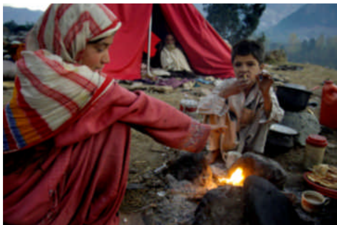
Besides official tent camps, hundreds of "spontaneous settlements" of earthquake survivors have sprung up in the NWFP

While more than a dozen official tent camps have been established by the Pakistan government and army in North West Frontier Province (NWFP), literally hundreds of so-called "spontaneous settlements" have also sprung up, ranging from those with a few families to those with several hundred families. Interagency efforts to map these settlements are ongoing. Four new camps have been created during the reporting period, including one at Havelian, south of the earthquake zone. Official government policy is to try and consolidate these settlements, but how this will be achieved, and where new camps will be created is not yet clear.