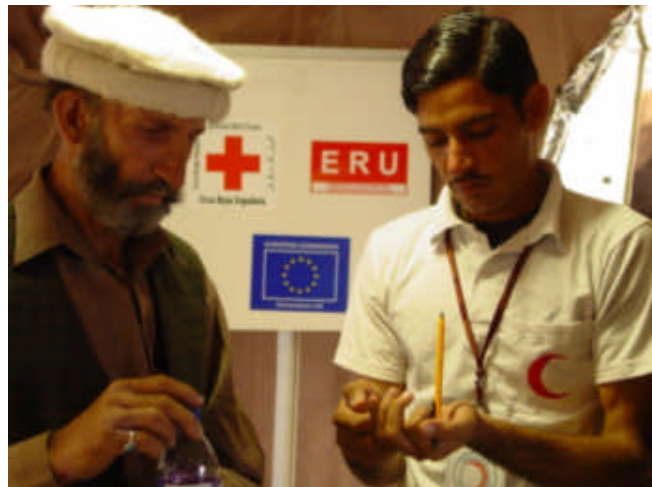
Medical help being received at the Spanish Red Cross basic health care ERU in Balakot

More communities now have access to clean water produced by the two water sanitation emergency response units (ERUs) in Balakot and Batagram. In addition, the Federation's transport support unit is trucking filtered water. In total, nearly 40,000 beneficiaries have been reached to date. In both towns Federation delegates are training local women on the dissemination of hygiene promotion in camps and villages.