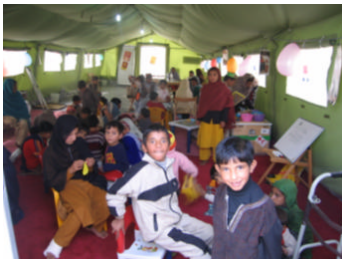
Children's play tent at the Federation field hospital in Abbottabad

The Federation multi-national field hospital in Abbottabad continues to build up its capacity in a number of ways - in terms of the quality of care, the number of staff and the physical structures or support. The facility can now provide for a higher patient case load depending on needs in the months to come. Over 200 patients have been admitted and 132 operations performed since the hospital opened. The average daily occupancy rate after the first days has been 98 patients. Children have been immunized against polio, measles, diphtheria and hepatitis-B, while a number of adults have been immunized against tetanus.