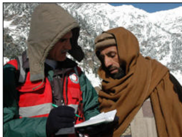
An RDRT helicopter operations team member carries out assessments in the Kagan Valley to determine the needs of people living in remote and isolated mountain communities

Two months after the disaster, the Federation and the PRCS is continuing to deliver relief and carry out further assessments by air, dispatching self-sufficient regional disaster response teams (RDRTs) from South and Southeast Asia together with PRCS volunteers by helicopter to remote mountain areas.