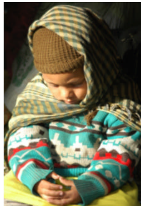
With a more intense winter than usual, hundreds of children in quake-stricken areas have succumbed to pneumonia

On 1 December, a missile attack on a house in North Waziristan, near the Afghan border, killed five people, amongst them reportedly an Al Qaeda operative. Agencies are monitoring security in the area. On the same day, an earthquake measuring 5.1 on the Richter scale jolted the region, however, no casualties or damage has been reported.