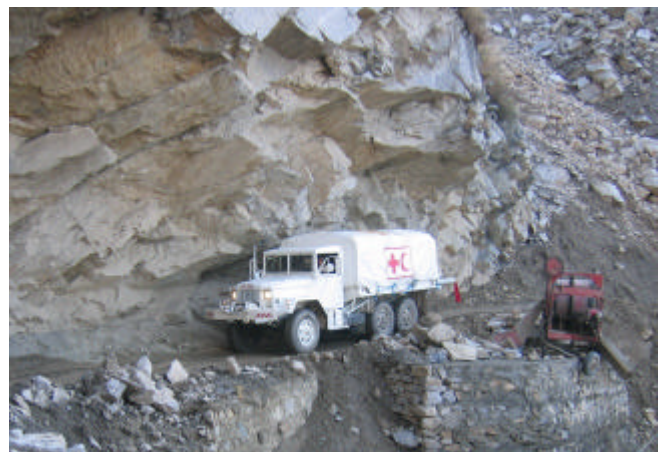
Norwegian Red Cross donated M6 trucks are being used to transport relief supplies to earthquake affected communities living in inaccessible areas in the Allai Valley

Authorities report that more than 400,000 houses need to be built in northern Pakistan for those left homeless by the earthquake. The government plans to provide 175,000 Pakistani rupees (USD 2,930) to help replace each house that has been destroyed or damaged. Officials say around USD 4 billion will be earmarked for longer-term reconstruction, expected to begin in April 2006.