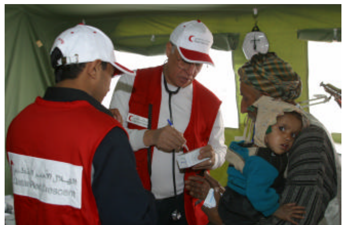
The Qatar Red Crescent has treated almost 6,000 patients, nearly one third of them children, at the field hospital in Bagh

The Qatar Red Crescent Society (QRCS) has expanded its activities, and in addition to its medical programmes, is now providing a relief team which is integrated into and supporting the Federation/PRCS operations in Battal.