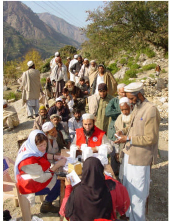
Mobile health teams travel to remote villages in the Besham area to reach affected people

In recent days, tent communities in Balakot have been better organized and the per capita health needs have been addressed both at the primary and secondary level. The Federation travelled further north of Balakot to investigate gaps in health care and to identify locations for the mobile health teams to work. Clearly evident during the assessment was that areas around Balakot and the Kagan Valley appear to be well served. To support efforts in this area, the Federation agreed to provide a newly set up Cuban health facility in Ghnool Camp 1 north of Balakot (population 1,500), with 15 hospital beds, 2,000 bed sheets (for camp residents and the hospital), one surgical kit containing disposable items for 100 procedures, a tetanus vaccine fridge, 200 tetanus vaccines and 200 tetanus immunoglobulin, and 12 sets of surgical scrubs. The Federation reinforced the need for the facility to refer complicated and major cases to the field hospital in Abbottabad for treatment.