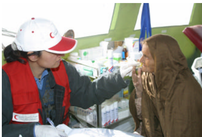
Over 65 percent of the patients that visit Federation field hospitals in Pakistan are women.

The Federation multi-national field hospital in Abbottabad continues to provide care to patients referred from the Ayub Medical Complex (AMC) and Federation/PRCS basic health care units in Balakot, Batagram and Besham. Transportation of patients and patients' compliance with referral advice are major reasons for the low referrals from other health facilities. Physiotherapy and psychosocial sessions continue to be the most prominent services provided, with some 405 and 279 patients benefiting from these services, respectively.