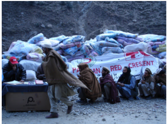
The Federation and PRCS have scaled up relief operations to reach communities living in remote areas of Kohistan and the Allai Valley in the next few weeks

The Government of Pakistan has approved 30 million Pakistan rupees (660,000 Swiss francs) for the National Volunteer Movement (NVM), established after the earthquake for young volunteers to assist with relief and rehabilitation efforts. Some 40,000 registration forms have been issued across the country, but so far only 5,220 applications have been received. The NVM plans to induct approximately 3,000 volunteers in earthquake-affected areas for the rehabilitation process and is seeking skilled people in the medical, educational and construction fields. Female volunteers, in particular, have been encouraged to apply in the areas of health, education, camp