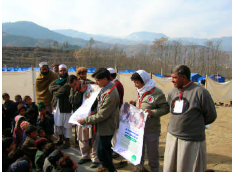
Basic health education and hygiene promotion is presented to community groups

A new field delegate has joined these teams during the reporting period and is planning to do a formal assessment of the villages presently visited by the mobile health teams and of further villages in the area. A second expatriate health delegate joined the team in Balakot to support further mobile health teams. There are however some gaps in the schedule of mobile clinics due to the reliance on helicopter for transport to villages and it has been decided to concentrate on areas with greater year-round accessibility, to reach the health needs of the maximum number of beneficiaries in these neglected areas. The teams are also in discussion with district health authorities on further possible support to existing health staff and are examining whether to provide health and hygiene promotion support to two camps currently supported by the Cuban medical teams.