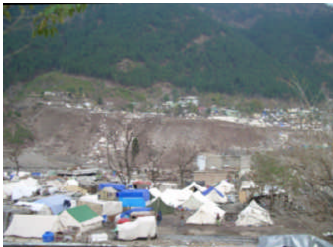
Spontaneous tent villages are springing up and causing concerns for hygiene and safety.

This week saw the weather worsen in Pakistan, with dense fog and snow in mountainous areas and rain and mud at lower levels. Bad weather has stopped air operations over the past few days and has constrained some road operations. This slightly delayed the planned scaling up of the relief operation. Nevertheless, the weather has picked up in the past few days and there are still hopes to reach the number of target beneficiaries by mid-January. The knock-on effect of bad weather on population movement however may affect planned operations, and will have to be monitored in the coming days.