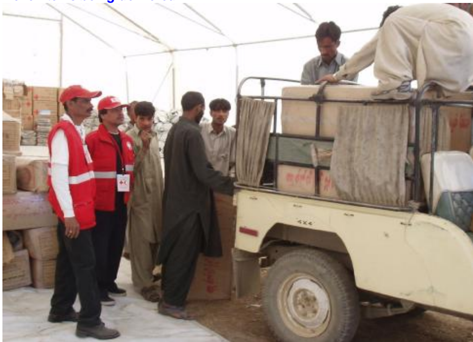
Relief items being delivered.

During the past weeks the weather has been reasonably good and intermittent sunny dry weather has enabled the scaled up relief operation to continue as planned. However, bad weather is still a constant threat to the operation, with heavy rains during the past few days causing muddy conditions in the camps. As a result, landslides have blocked mountain roads but the Pakistan army is working hard to clear access roads as best as possible.