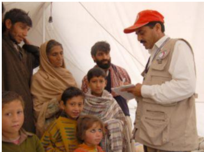
A PRCS volunteer conducting an assessment of a family in Tandah Village (NWFP) living in a Red Cross and Red Crescent supplied tent.

The visit of the US president in the first week of March resulted in tight security restrictions in Islamabad. As a result, the Federation delegation in Islamabad closed for two days (3 and 4 March) and all field movements were restricted, but limited relief operations continued.