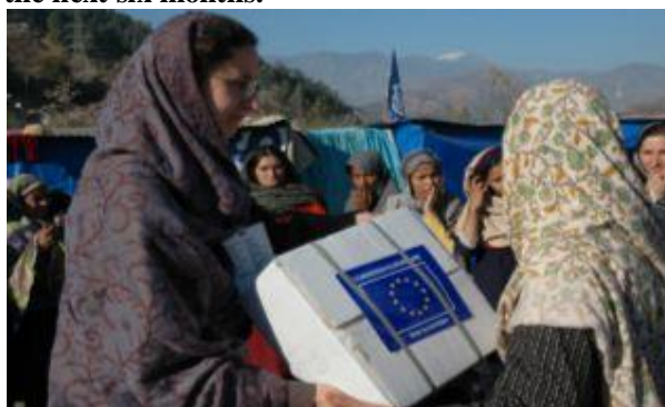
Distribution of ECHO-supplied hygiene kits in Balakot (NWFP) by Red Cross and Red Crescent staff.

To date more than 234,000 people have received some form of medical assistance as a result of Red Cross and Red Crescent activities. With large numbers of people on the move as they return to affected areas with the end of the winter, there is an increased risk of medical problems. WHO is scaling up immunization activities and is involved with UNICEF in Besham/Balakot, conducting mass measles immunizations for children between nine months and 15 year of age. This to prevent sporadic cases of observed measles which could spread to epidemic proportions.