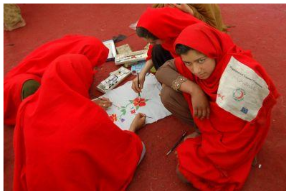
Women taking part in ECHO-supported Red Cross and Red Crescent psycho-social support activities in a tent camp in Garhi Habibullah.

With winter ending the emphasis is switching from emergency relief to recovery and rehabilitation. The feared second wave of deaths did not occur for a variety of reasons. The hardiness and resilience of the affected population was absolutely vital to their survival and cannot be underestimated. In addition, the combined efforts of the various elements of the relief operation also worked well together, with essential food, shelter and other non-food items reaching a significant number of earthquake survivors to support them through the winter. PRCS and the Federation have contributed to this response, and with a further 15,000 families assisted in the past month, have now assisted more than 105,000 families (approximately 740,000 people). This exceeds the target 81,000 families by almost 30 per cent.