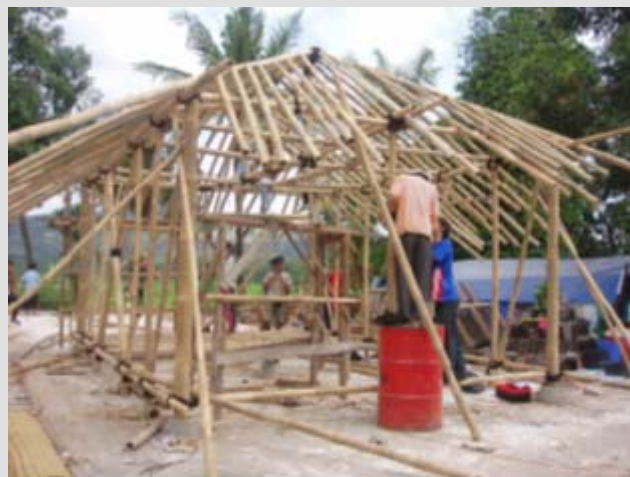
A model transitional shelter under construction in Bantul

The Yogyakarta earthquake operation is making headway, with more and more activities shifting towards fulfilling recovery needs and the plan of action being revised to reflect existing vulnerabilities and a longer-term vision. Together with the Federation delegation, the PMI has initiated toolkit distributions to aid families in reconstruction, and the first model shelter is complete, with more to come in 21 targeted villages. Home-based care for survivors that were seriously injured in the quake has also begun, with 190 special visits conducted so far. A communication plan that includes strategies to communicate to the beneficiaries and local communities, PMI staff and volunteers, as well as strategic partners of the national society is also being formulated.