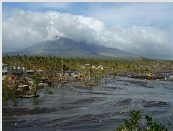
Flood waters sweep through villages around Mt. Mayon.

(click here to link directly to the attached appeal budget)