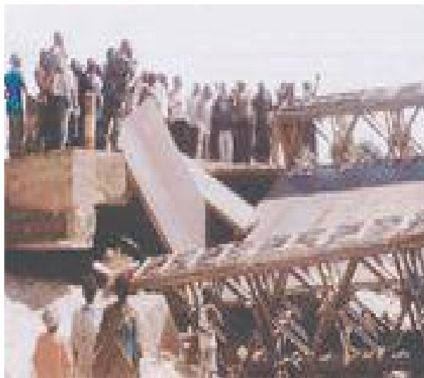
Damaged steel bridge in Kulungungu Municipality. This bridge links Ghana and Burkina Faso as well as other Sahelian countries.

CHF 100,000 (USD 84,280 or EUR 60,734) was allocated from the Federation's Disaster Relief Emergency Fund (DREF) to support this operation. Unearmarked funds to replenish DREF are encouraged.