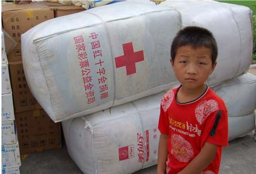
Relief supplies of food and water and delivered by the Red Cross Society of China at the most critical moments for those displaced by the flooding.

Click here to return to the title page or contact information