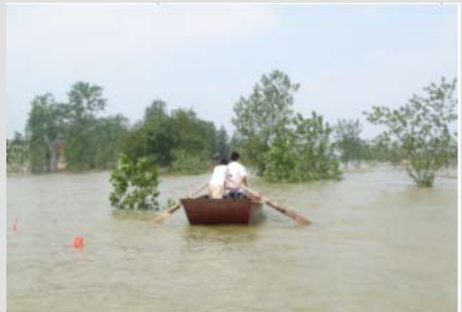
Villagers using boats after waters rose to high levels.

Operational Summary: Already, more than 105 million people have been affected by floods alone this year in China. Severe flooding in Anhui, Sichuan and Hubei provinces, which were the most severely affected provinces, have caused the evacuation of 3.6 million people. At least 425 have been killed, with another 110 missing. More than one million rooms 1 have been damaged and at least 360,000 rooms completely destroyed. It is estimated that 6.4 million hectares of farmland have been destroyed and economic losses are mounting to CNY 33.5 billion (CHF 5.3 billion). DREF funding will be used to support the Red Cross Society of China's (RCSC) provincial branches in Anhui, Sichuan and Hubei to provide rice, blankets and water purification materials to affected families in the flooded areas. These activities are being coordinated through the RCSC headquarters which is seeking national support and support from RCSC branches to meet immediate needs in other provinces affected by recent floods and landslides through a national appeal.