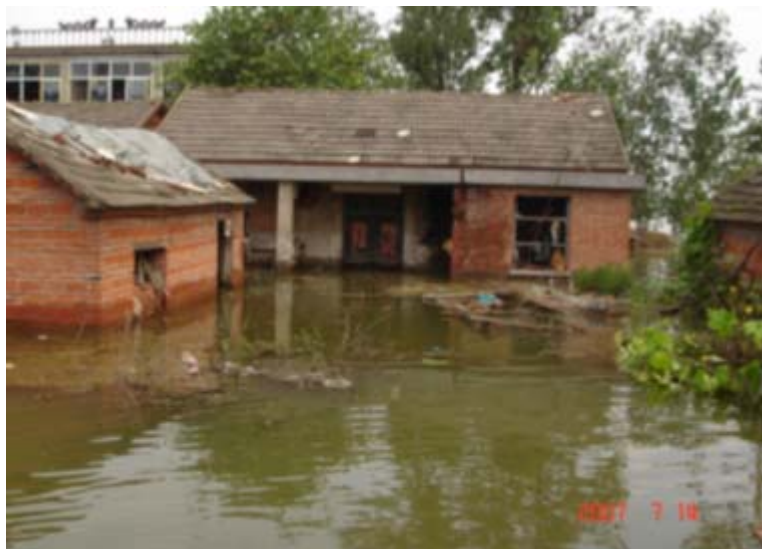
Flooding in Anhui province is considered to be the worst in more than 50 years.

The floods caused by continuous torrential rain since mid-June have affected over 105 million people and 3.6 million people have been relocated as the rainy season coupled with fierce floods continues to batter central Huaihe river and southern China. Millions of people stretched across 24 provinces, autonomous regions and municipalities have been lashed by torrential rains and floods. Natural disasters thrust millions of rural poor into a vicious cycle of not having sufficient reserves to cope with disasters when they strike thus being driven back or further down into poverty by the multitude of disasters that occur each year in China.