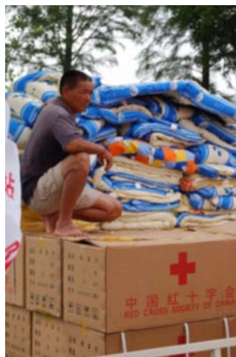
Relief supplies provided by the Red Cross Society of China arrive and are ready for distribution.

Based on the 15 July findings of an assessment team led by the RCSC's vice-president, the CHF 240,000 allocated through the Federation's DREF will be used to support RCSC's Anhui, Sichuan and Hubei provincial Red Cross Branches to provide rice, blankets and water purification materials to affected families in these three provinces. These activities are being coordinated through the RCSC headquarters who are seeking national support and support from RCSC branches to meet immediate needs generated by the floods in an additional number of provinces through a national appeal.