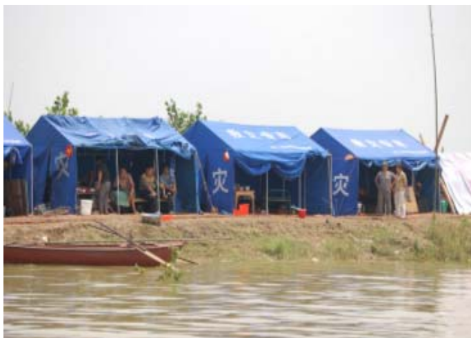
Temporary shelters have been set up along the flooded areas and are housing millions.

In Anhui Province, floods have affected more than 20 million people, claiming the lives of 30 and causing the evacuation of over half a million from their homes. It has been among the worst-hit provinces by this season's floods. Considered as a poor province, the Anhui provincial branch has been actively involved in relief operations and has been distributing relief supplies since June to flood affected counties deploying medical teams and volunteers who have treated and helped people affected by the disasters.