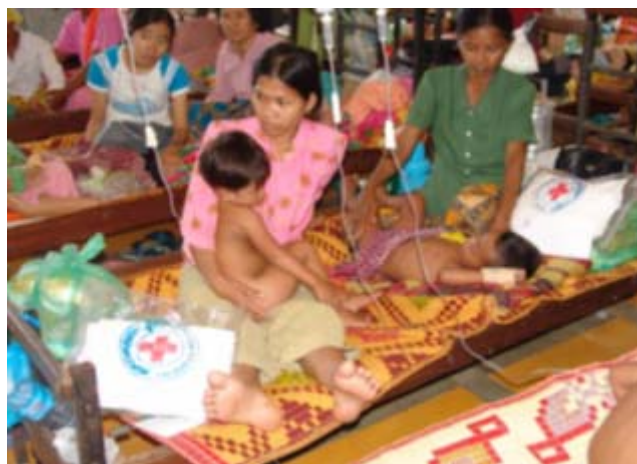
Just a few of the many hundreds of children that required hospital treatment.

This year's dengue fever and dengue haemorrhagic fever cases are more than double compared to previous years, with the latest official reports 1 having reached 34,542 cases, and resulting in 365 deaths (Case Fatality Rate 1.1 percent). According to the table below, the incidents have dramatically dropped since July. However, the country is still at risk of outbreak relapse as some provinces are still at high risk, and reporting an increase in the number of cases. Secondly, the rainy season has not ended.