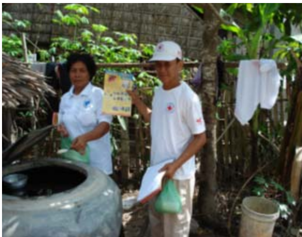
Red Cross volunteers collaborated with the MoH village health volunteers to distribute Abate to households with water jars in rural villages.

In addition, 19 out of 24 Red Cross branches locally-raised funds to mobilize, along with the provincial departments of health, Red Cross volunteers (RCV) and villagers to conduct clean-up campaigns which included the RCV disseminating important information about dengue fever and its effects.