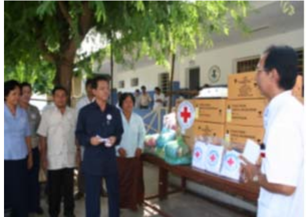
CRC also sent donations to hospitals in Takeo province.

In response to the dengue epidemic, Cambodian Red Cross (CRC), launched a nationwide alert and appealed to local businesses and the general public to support CRCs efforts to assist in the national drive to combat dengue fever. There was a generous response and, as a result, the national society headquarters was able to donate 61,20 bottles of serum to several hospitals. It has also supported 1,615 families with children affected by dengue by providing food/non- food kits consisting of canned milk, instant noodles, canned soya milk, mosquito nets, blankets, clothes and some cash assistance.