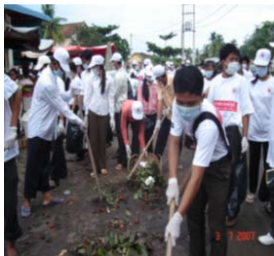
CRC volunteers participating in a cleanup campaign.