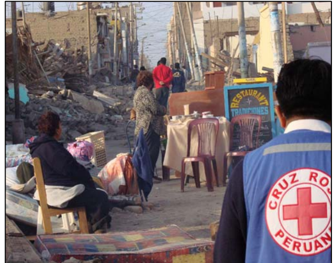
The PRC responding to the needs of those affected in Pisco.

The lack of information and coordination on the ground and the increasing insecurity has caused an initial delay to the planned schedule of distributions.