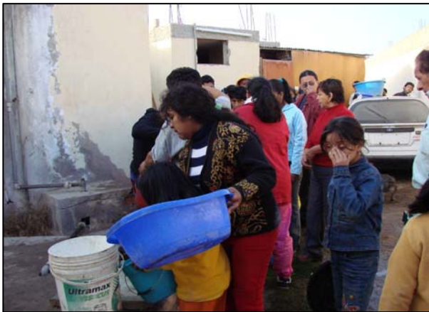
As the need for water increases, people line up to see their basic needs met.

The lack of power lines and the desperate situation many people are in is causing insecurity in the affected areas, with reported cases of robbery and assaults. Several vehicles loaded with humanitarian aid have been targeted by looters and in some cases they were unable to carry out distributions. The entrance of the city of Chinchá is blocked by the police in order to avoid potential disorders or robberies. Government authorities are taking measures to reinforce law and order.