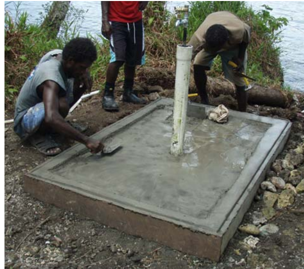
Solomon Islands Red Cross volunteers fixing pipes for tap-stands in Kena, Kolombangara. International Federation.

Between February and June 2008, SIRCS and the International Federation carried out the rehabilitation of 15 water systems in 15 targeted villages. The rehabilitation works involved repair and new construction when necessary of spring intakes and dams, leakage repair in main and distribution pipelines, tank rehabilitations, crossings, skylines and submarine pipes, new tap-stand construction and repairs as well as other minor works. During the operation, six new dam/spring intakes were constructed, seven old intakes were repaired and seven ferro-cement storage tanks with sizes up to 50 m 3 were rehabilitated. In addition, more than 8,000 m of new pipe was placed, including 1,530 m of galvanized iron (GI), 5,850 m of polyethylene (PE) and 660 m of PVC pipes. Up to 14 villages were provided with rain-catchments (61 units constructed). Additionally, the International Federation water and sanitation team produced a technical construction guidance document and a water and sanitation activities CD as technical support for RWSS. Before the rehabilitation, six water systems were not working and ten partially working. After the SIRCS and the Federation rehabilitated 15 water systems, 13 of them are functioning and two experienced problems related to operations and maintenance. Please refer to Annex A for a detailed summary of works carried out according to priority in selected areas.