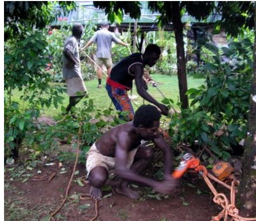
The International Federation-supplied tools and equipment were used to realign earthquake-affected houses.

SIRCS and the International Federation completed the shelter damage assessment, tools distribution and milling on both Kolombangara and Vella La Vella by mid-January 2008, as per the following tables.