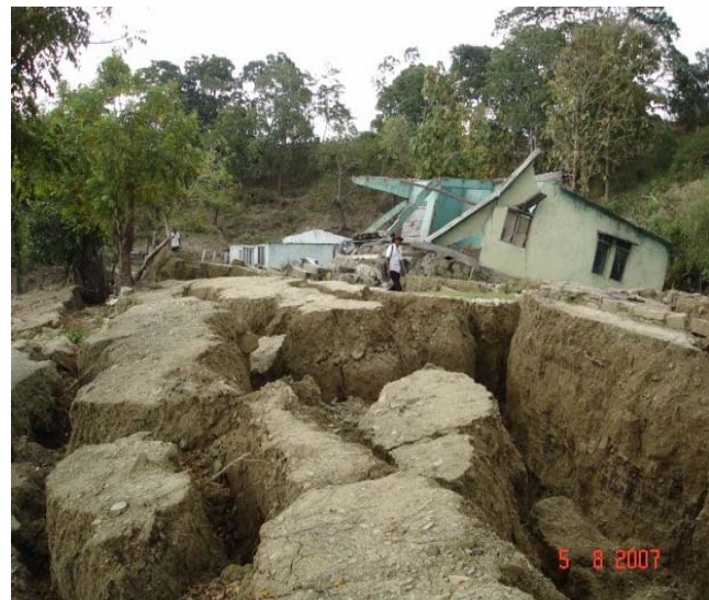
A house destroyed by the flooding and landslides, Suai.

Government/United Nations Development Program (UNDP) assessments show that a total of 3,119 houses were destroyed, 2,242 damaged and many more undamaged but illegally occupied 1 . So far, 584 transitional shelters have been constructed in the capital city of Dili by the government and a non governmental organization. (Source: GoTL 'Levantamento de dados' data assessment with support and analysis provided by UNDP, March 2007 ).