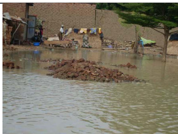
Floods in the Moyen-Chari region of Chad

<click here to view the attached Emergency Appeal Budget; here to link to a map of the affected area; or here to view contact details>