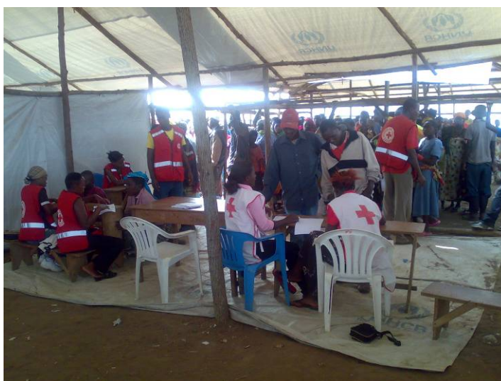
Volunteers of Uganda Red Cross Society register refugees at Matanda transit camp, Kisoro

Summary: As conflict in DRC escalated in November and December 2008, the three National Societies of Uganda, Rwanda and Burundi scaled up their operations in border areas with DRC in response to predicted and actual movement of refugees. Uganda received the highest number of refugees in December and January and played a lead role in receiving, registering and distributing relief items to over 9,000 people. A transit camp was opened to accommodate these refugees in Matanda. Uganda Red Cross Society worked as a partner with other humanitarian actors including United Nations High Commissioner for Refugees (UNHCR) to manage and provide services in transit and permanent refugee camps in Kanungu and Mbarara Districts.