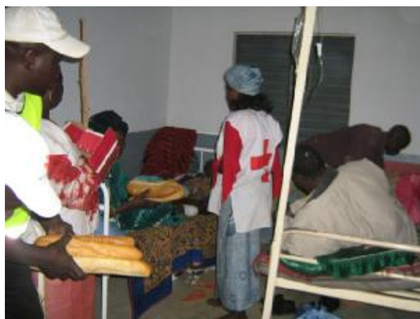
Cameroon Red Cross volunteers have started distributing food to Chadian refugees