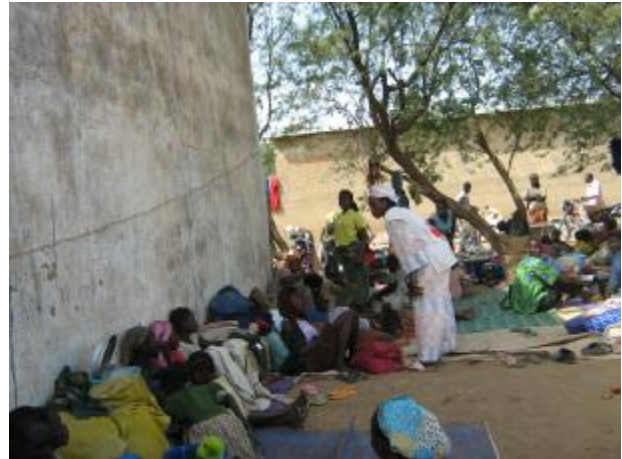
Most refugees have been living under the tree since their arrival from N'Djamena

On 6 February, 2008, a UNHCR Representative in Kousseri announced that about 52,032 refugees have been registered, 30,000 of whom are in a vulnerable situation and need immediate assistance. These vulnerable people are now residing in unsafe sites and under trees, but efforts are underway to find better accommodation.