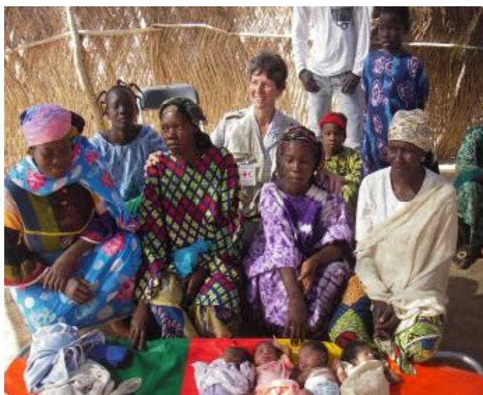
Photo below: mothers and children in the French Red Cross Basic Health care Emergency Response Unit