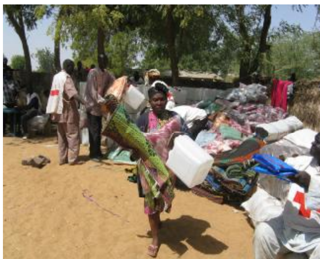
Photo above: Cameroon Red Cross volunteers distributing emergency relief items to refugees.

Summary: The CRCS has been operational since the start of the refugee influx, and with the support of the International Federation, is managing to increase its responsibility and effectiveness to deliver the planned assistance. Red Cross staff and volunteers have distributed emergency relief materials including food and non-food items, and provided vital support in the transfer of refugees to the Maltam refugee camp (located some 30 kms from Koussari town and planned to operate at least until June) where some 8,000 refugees are currently accommodated. An estimated 30,000 refugees have reportedly decided to voluntarily return to N'Djamena. Maltam camp is regarded as prone to flooding and is