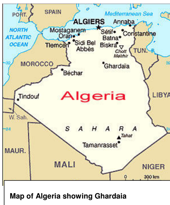
Map of Algeria showing Ghardaia

<click here to view the attached Emergency Appeal Budget; here to link to a map of the affected area; or here to view contact details>