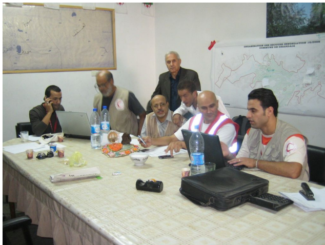
The coordination of the Algerian RC with national and local authorities is effective

Soon after the disaster, emergency cells were established at the headquarters level and in Ghardaia. The coordination with national and local authorities is effective and the National Society is part of the national disaster plan (NDP) - Plan Orsec. The revision of the NDP is still under completion.