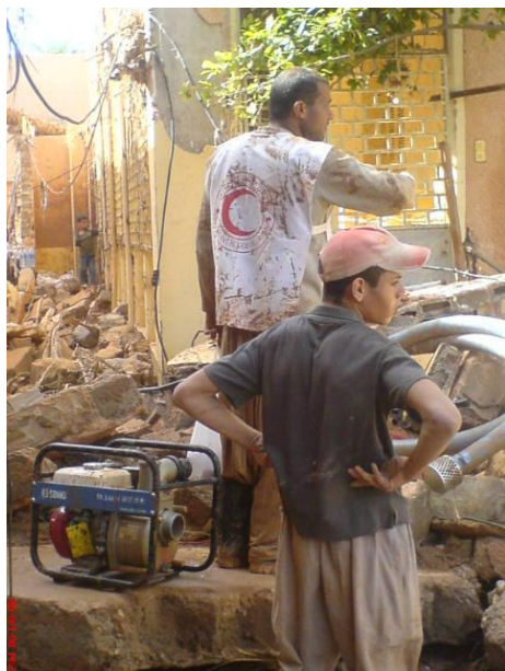
The Algerian RC has been present on the site since the very first hours of the disaster

The Algerian RC has been present on the site since the very first hours of the disaster. The Algerian RC intervention teams had a national coordinator for disaster management and a coordination committee at the headquarters of the local committee. 18 teams of volunteers were set up in the field, including a team of intervention by site. In addition, a logistics team was in place for unforeseen needs and redeployment of pumps. A restoring family links (RFL) service was put in place and 16 cases of missing persons were registered by the Algerian RC committee in Ghardaia.