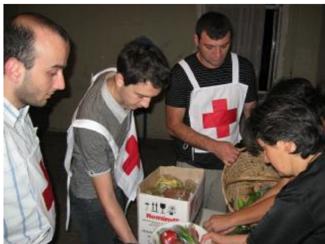
Bread and fresh vegetables are being delivered by Georgian Red Cross volunteers to the displaced communities.

Summary: By 26 August the fighting that had erupted in South Ossetia, Abkhazia and near the Georgian capital of Tbilisi earlier in the month had ended. However, the conflict has left tens of thousands of people in the region displaced and in need of assistance. In Georgia, these displaced people are the key target group that the Georgian Red