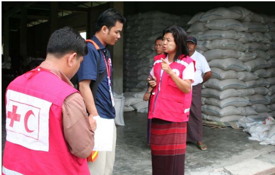
Pipeline up and running: the Federation's international supply chain is up and running bringing in tonnes of relief daily. Here rice from the World Food Programme is being prepared for distribution from a Myanmar Red Cross Society warehouse.

Discussions are underway with the national society to look at bringing in more volunteers to support operations in the delta. Initial agreement has been given to establish ten hubs in the delta, each of will be staffed by four people, two recruited and trained in Yangon and then two more locally recruited and trained by those recruited in Yangon in each case.