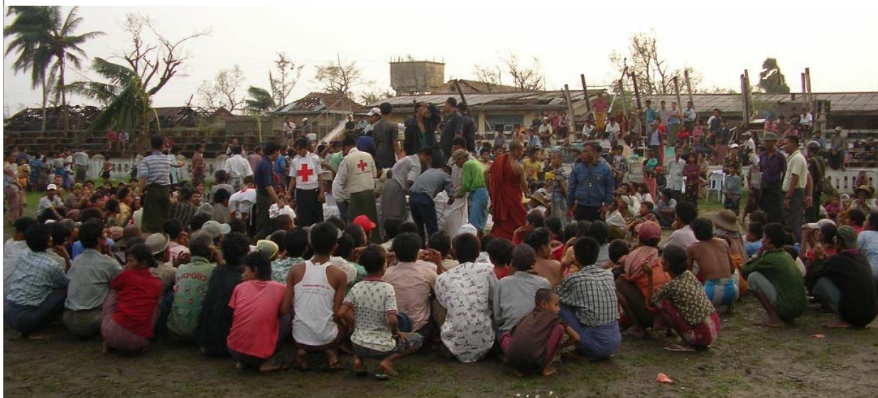
Stuck in the middle: Red Cross volunteers circulate among tens of homeless people in Bogale township. (International Federation).

A significant shift in strategic thinking has occurred to try to navigate some of the main issues facing this operation. Principal among these is a proposal to recruit and train local people in Yangon in basic relief management who would then move to ten agreed hubs in the delta (various university students have already expressed an interest). Once on site, each team of two would recruit and train two more local recruits (in total, four people per hub) to manage the relief operation from the delta. Initial discussions are underway with a local training company. Any progress on this will be reported on. In addition, before the cyclone, the regional office had begun a new approach to training Myanmar Red Cross Society (MRCS) by bringing key national society personnel to Bangkok. This methodology, which was successful in advancing financial management in MRCS, is now being looked at as a way to strengthen local capacity to manage the Nargis operation, particularly beyond Yangon. Few international staff (from all organizations) are being granted visas for Myanmar; and once in country, it is difficult for international personnel to move beyond the Yangon limits.