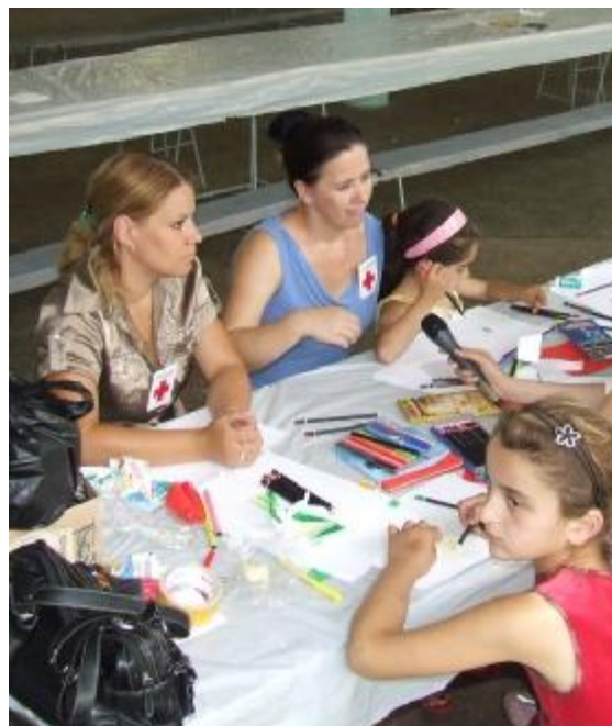
Psychosocial workers of the Russian Red Cross from Beslan organize art sessions for refugee children in the dining room of Alagir refugee centre.

The support assumes a gradual return of the refugees and is expected to be implemented over a period of 6 months and will therefore be completed by 28 February, 2009. A final report will be made available three months after the end of the operation (by 31 May, 2009).