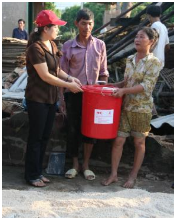
Moulding rice spread in front of damaged houses in an attempt to save it for consumption. in Luc Ngan district, Bac Giang province

The VNRC headquarters dispatched two teams to facilitate the emergency response activities in the provinces of Bac Giang and Quang Ninh within 24 hours after the incident. The International Federation's country office Disaster Manager has joined the relief team in Bac Giang province. On 27 September, some 1,000 household kits containing cooking utensils, a mosquito net, two blankets, a ten-litre water bucket and a 40-litre plastic water tank were delivered from the VNRC headquarters' warehouse and were distributed to affected families on the same day in Bac Giang and Quang Ninh province, by the disaster response and relief teams. The remaining household kits have since been distributed to families in these two provinces and in a further two provinces, Son La and Lang Son.