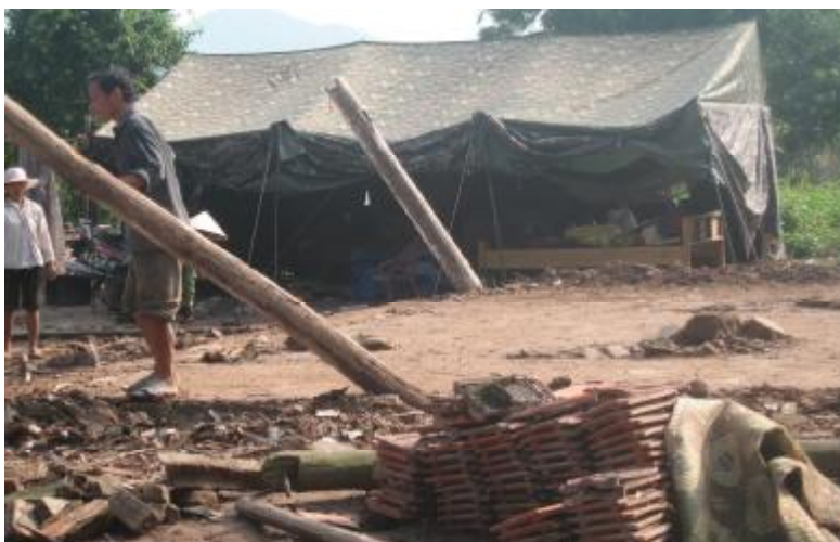
One of the thousands of families struggling to survive in a temporary shelter after the flash floods.

In the wake of the recent typhoon Hagupit, six provinces were seriously affected by flash floods (Quang Ninh, Son La, Lang Son, Bac Giang, Vinh Phuc and Lao Cai) Of these six, two have been identified by VNRC as the worst affected and in need of further external assistance - Bac Giang and Son La. In Bac Giang, some 62