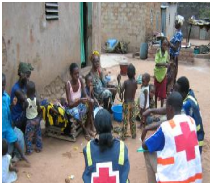
Home visit to Sindou (in the Waterfalls region), 520 kms from Ouagadougou)

From January 2009 to May 2009, a serious outbreak of meningitis and measles occurred in Burkina Faso, leading to 52,812 suspected cases and 336 deaths from measles, and 4,052 suspected cases and 521 deaths from meningitis. The health district of Sindou (at the border with Côte d'Ivoire and Mali) was severely affected. To respond to these epidemics, the Burkina Faso Red Cross (BFRC), in coordination with the Health Ministry, mobilized volunteers for sensitization activities (door-to-door awareness, and focus groups) and immunization (vaccination campaigns).