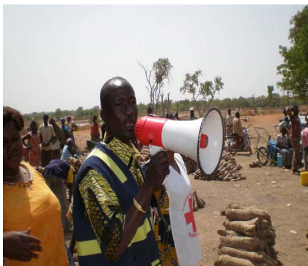
In Burkina Faso volunteers are active in sensitizing the communities.

Summary: An outbreak of measles and meningitis has occurred in Burkina Faso. The meningitis epidemic broke out in four health districts: Solenzo, Toma, Manni and Batié. As for the measles epidemic, it affected three other ones, Bogodogo, Fada and Sindou. A number of 178 people have been confirmed dead due to meningitis and 13 from measles. In response to those two outbreaks a DREF has been launched. The Burkinabe Red Cross Society (BRCS) plans to mobilize its volunteers for health education and sensitizing activities.