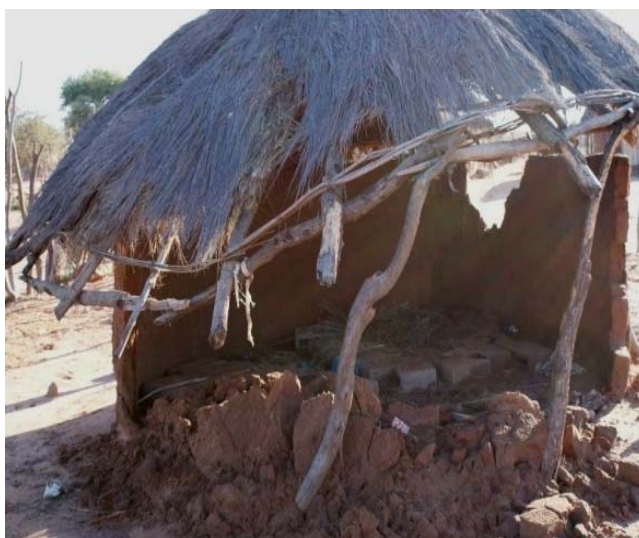
One of the damaged houses in Kweneng district

The occurrence of heavy rains in the central provinces of Botswana in June 2009 caused seven districts to flood and affected a total of 620 families or 3,100 individuals. The affected households lived in mud dwellings that collapsed in the heavy rain, leaving the families in need of emergency shelter, blankets and food. The damage assessments being undertaken by BRCS, however, may reflect an increase in the number of affected families.