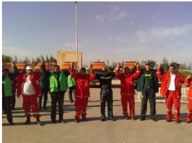
Palestinian Red Crescent and Egyptian medics meeting at the Rafah's border

Summary: a total of CHF 446,524 has been allocated from the Federation's Disaster Relief Emergency Fund (DREF). The first allocation of CHF 346,524 was made on 10 January 2009, with a second allocation of CHF 100,000 on 20 January 2009 to provide additional support to the Egyptian Red Crescent Society (ERCS) for the deployment of staff for contingency planning and training, as well as supplementary warehousing capacity. Following the cease fire, it is expected that relief assistance will continue through Egypt at an increased pace in the coming weeks, which further justifies an increased logistics support to the Red Crescent.