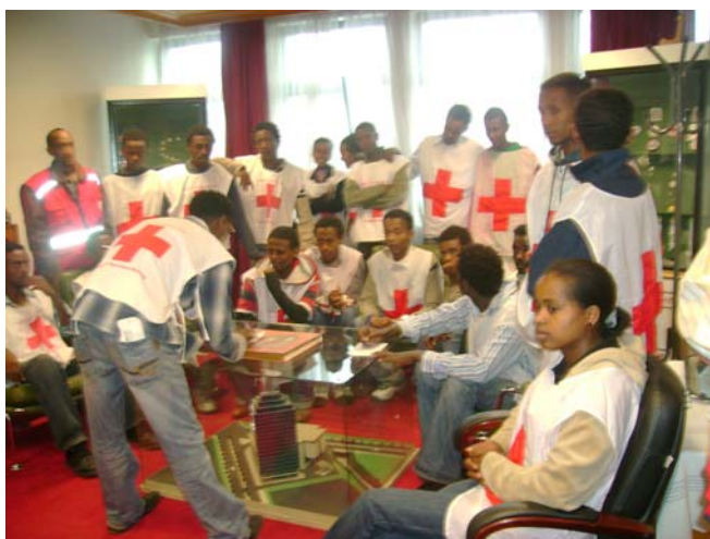
Orientation session for ERCS volunteers before deployed to the Red Cross CTC in Addis Ababa

Following the current Acute Watery Diarrhoea (AWD) outbreak in more than 6 regions of Ethiopia, the Federal Ministry of Health (FMoH) has made an appeal to all partners to mitigate the ever increasing AWD outbreaks in the country.