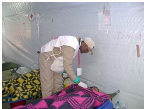
Red Cross volunteer taking care of a patient at Red Cross case treatment centre (Menilik II hospital) in Addis Ababa

Emergency health need assessment in North Shoa was conducted by International Federation team in the beginning of September 2009. The International Federation team has come up with appropriate technical recommendations for the short, mid and long-term possible interventions as the way forward.