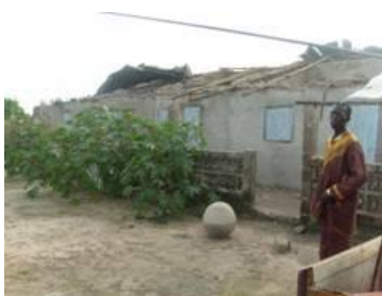
Houses destroyed by the wind storm

Summary: On 02 July a storm hit the area of River Region in Gambia. As a result, damages occurred to upper, central West and lower part of the region, affecting 2,350 persons. A total of 327 families were displaced to neighbours and relatives; because of the destruction of their houses, they do not have any shelter for themselves and their families.