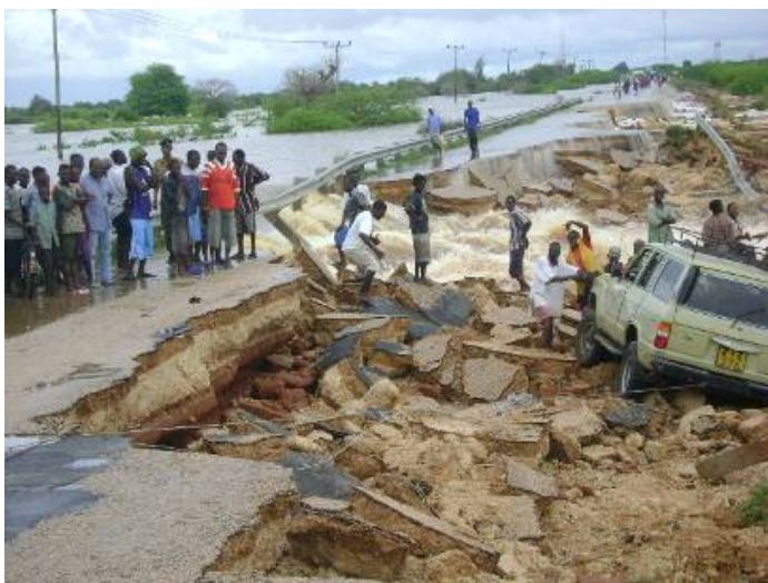
A section of the Malindi - Garsen Highway in Coast Province that was washed away after heavy rains impounded the area.

<click here for the DREF budget and here for contact details>